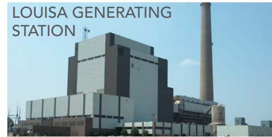
LOUISA GENERATING STATION